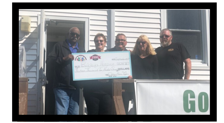
The Golden Mile Redemption Centre presented us with a cheque for $13,270!! This donation was made possible from the 264,400 bottles that were donated from our amazing community!!

We would love for you to consider bringing your bottles to 35 Linton Road off the Golden Mile as all proceeds come directly to Bobby's Hospice to support patient care.